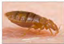
Adult bed bug feeding on a human